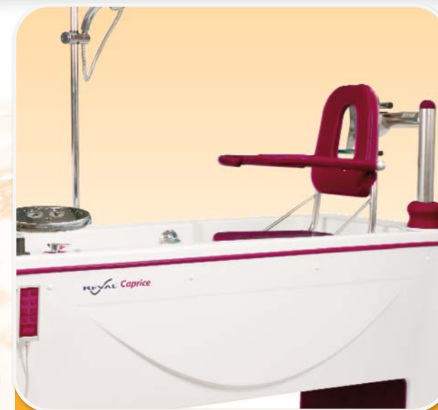
Integral hoist and seating system