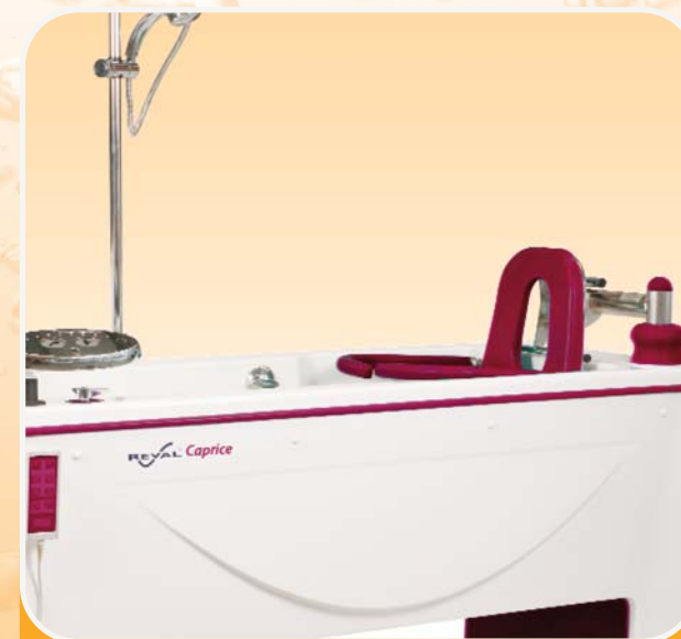
Integral hoist provides effortless transfers into baths