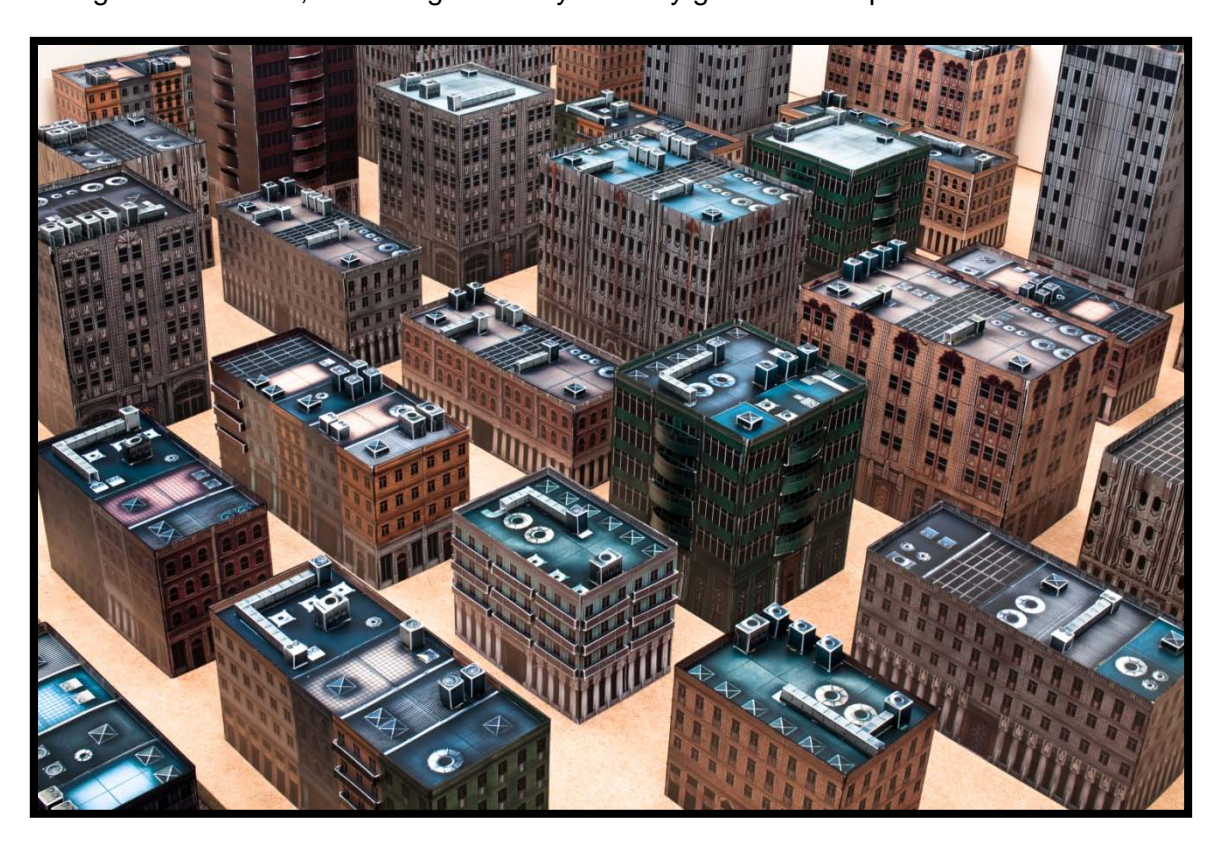
Here's a few I made earlier - don't worry, you won't need this many!

We've been working hard to ensure that these downloads are available from day one, giving all our players an extremely low cost scenery option from the start. We hope you have fun building a few of these, and using them in your early games of Dropzone Commander!