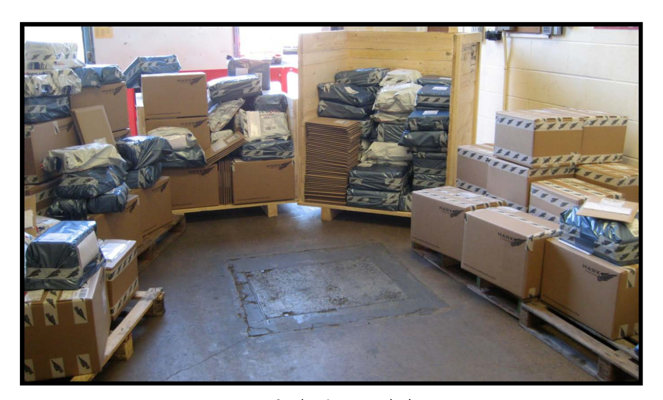
Stock going out today!

It's been 2 years and 8 months since I first put pen to paper and I'm excited to finally be able to let DZC loose. We've given it absolutely everything we could and I hope that you'll feel that our efforts and your patience have been well worth it!