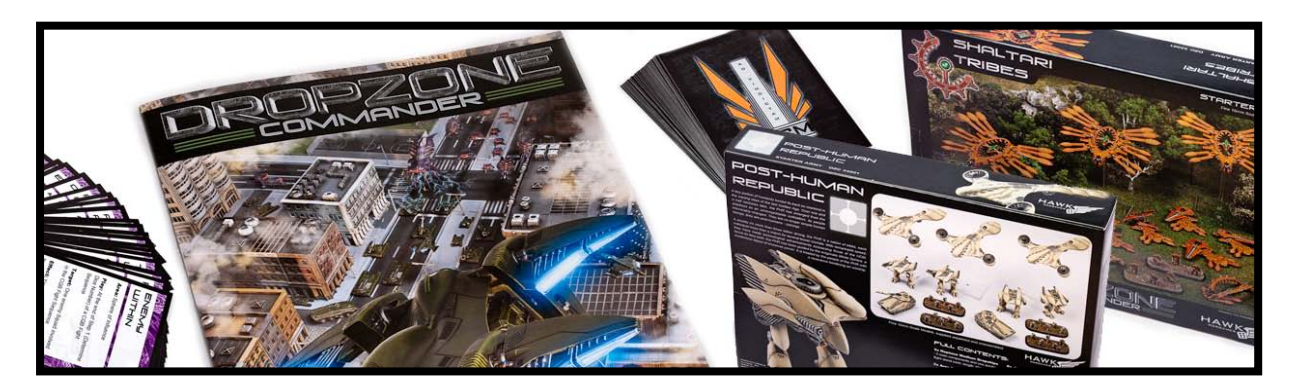
Products not to scale

Product photos have now been added to the Hawk Wargames website for the Rulebook, Command Cards and for the Starter Army retail boxes