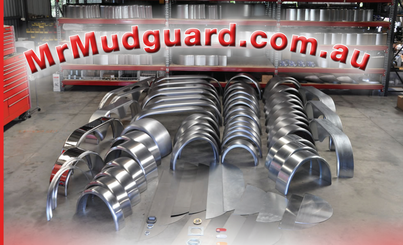
Round Style Mudguards for Trailers, Hot Rods, Bikes and Custom Street

Guardian Trailer Products James (02) 6024 3539 or 0407 011 148 7 Trafalgar Street Wodonga, VIC 3690 sales@mrmudguard.com.au www.mrmudguard.com.au http://stores.shop.ebay.com.au/Guardian-Trailer-Products Australia wide shipping available