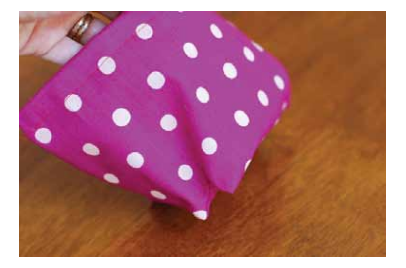
7) Turn pocket right side out. Push out corners.