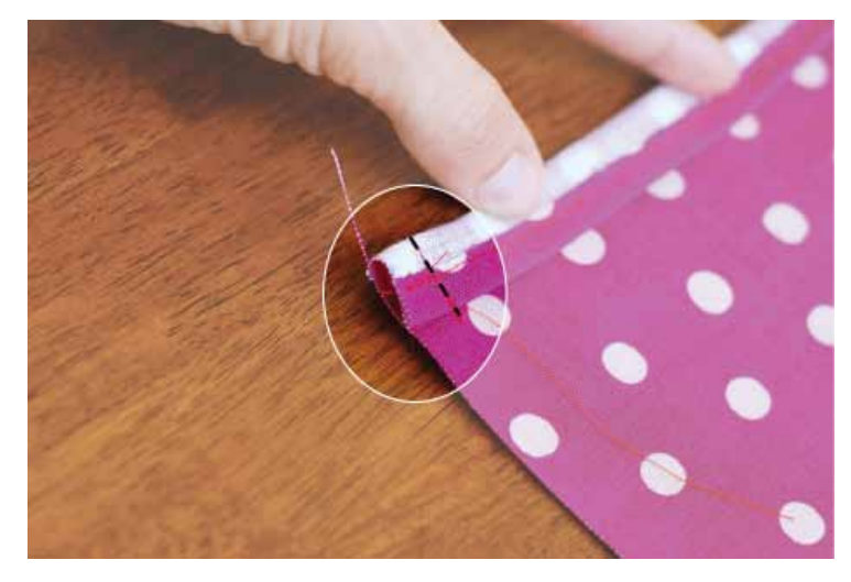
2) Fold hem to right side of pocket and stitch at sides.