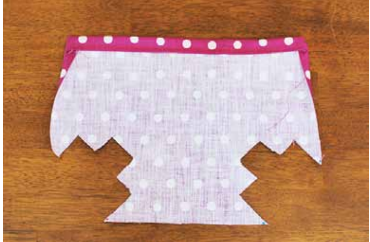
4) Your pocket should now look like this.