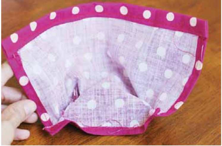
8) Fold seam allowance under and stitch or press if you don't want to see the stitching.