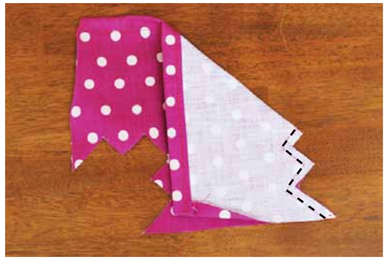
6) Beginning at red circles, stitch together along zigzag portion of pocket. Repeat with other pocket corner by matching blue circles and stitching together.