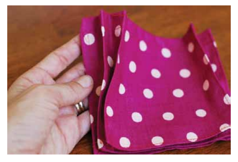
9) Form pocket pleats. This can be a little tricky. It helps to match up the bottom corners of the pocket and fold in the excess fabric to make the pleats. Edge stitch each pleat. Press pocket when finished.