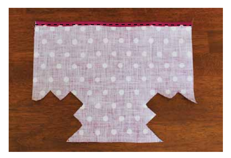
1) On pocket, fold hem 1/4" towards wrong side of pocket and stitch.