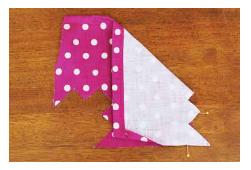
5) With right sides together, match red circles and pin in place.