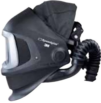
3M™ Speedglas™ Flip-Up Welding Helmet 9100XX FX Air with Breathing Tube & Free Premium Speedglas Carry Bag