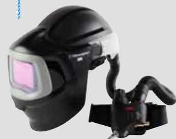
3M™ Speedglas™ Welding Helmet with 3M™ Versaflo™ V-500E Supplied Air Regulator