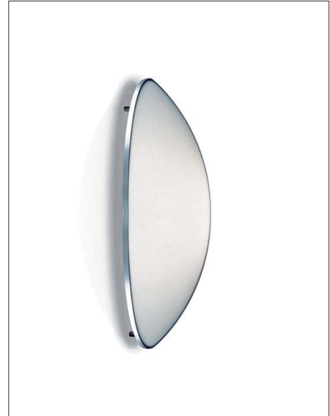
D14 a. - D14 a.fe

Reference code: D14 a. 1D14A0000520 alu D14 a.fe. 1D14AFL00520 alu D14 a.pi. 1D14A1P00520 alu D14 a.pi.fe. 1D14A1PFL520 alu