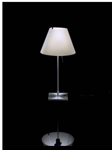
D13 pi. - D13 pi.c

Shade 1D130NP01502 white 1D130NP01501 black 1D130NP01510 blue 1D130NP01526 orange 1D130NP01528 ivory 1D130NP01525 pistachio 1D130NP01513 red