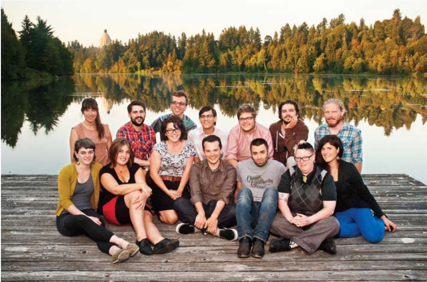
The staff of Olympia Coffee Roasting Company.