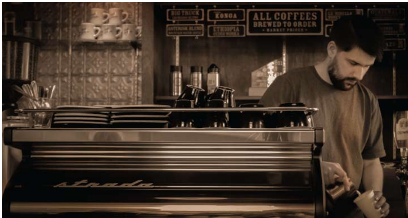
Olympia Coffee Roasting Co. flagship location, downtown Olympia.