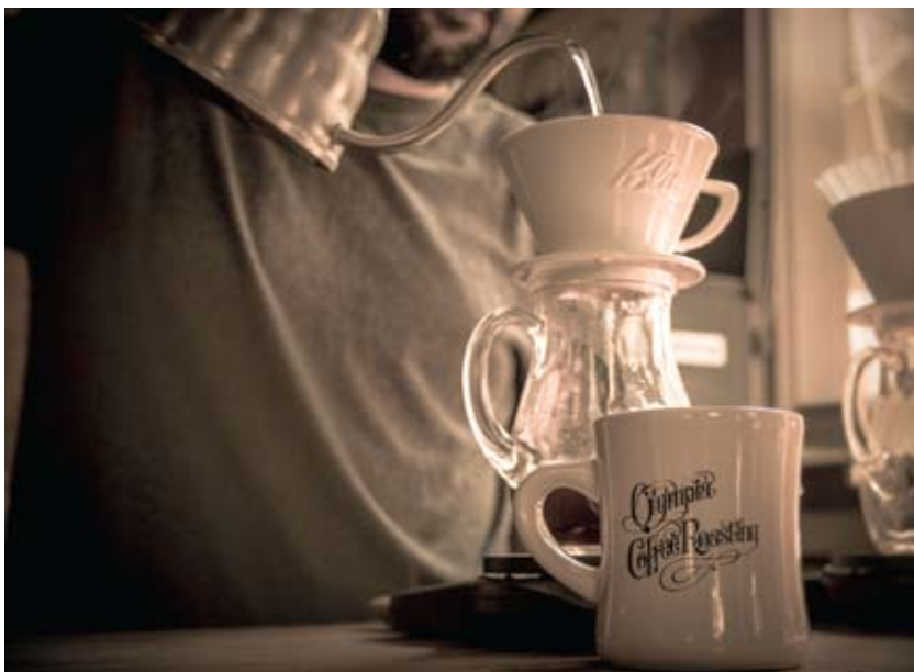
At Olympia Coffee Roasting Co., every cup of coffee is brewed to order.