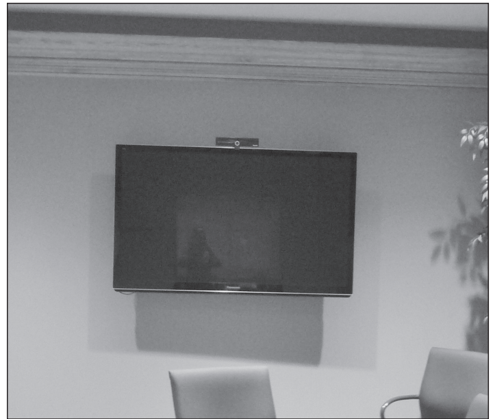
The new monitor and camera in the board room will be put to good use when the board and various committees hold meetings with others in various locations.

This gift has enabled the RFPA board to make extensive, progressive plans for the future. A 5-Year Plan was developed and approved by the board, covering a broad range of detail under the headings of Operations, Sales and Marketing, Facilities, Publishing, and Financial. The plan includes objectives, due dates, and funding.