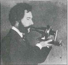
BELL TESTS EARLY PHONE