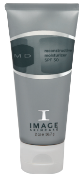
IMAGE MD reconstructive moisturizer SPF 30

INDICATIONS Aging skin, wrinkles and fine lines, pigmentation and other signs of aging.