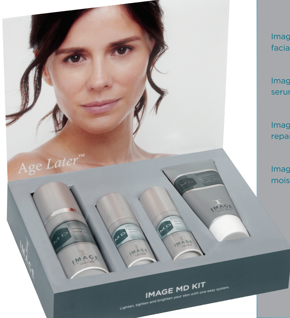
Image MD reconstructive facial cleanser

Image MD reconstructive serum with Tri-C Complex™