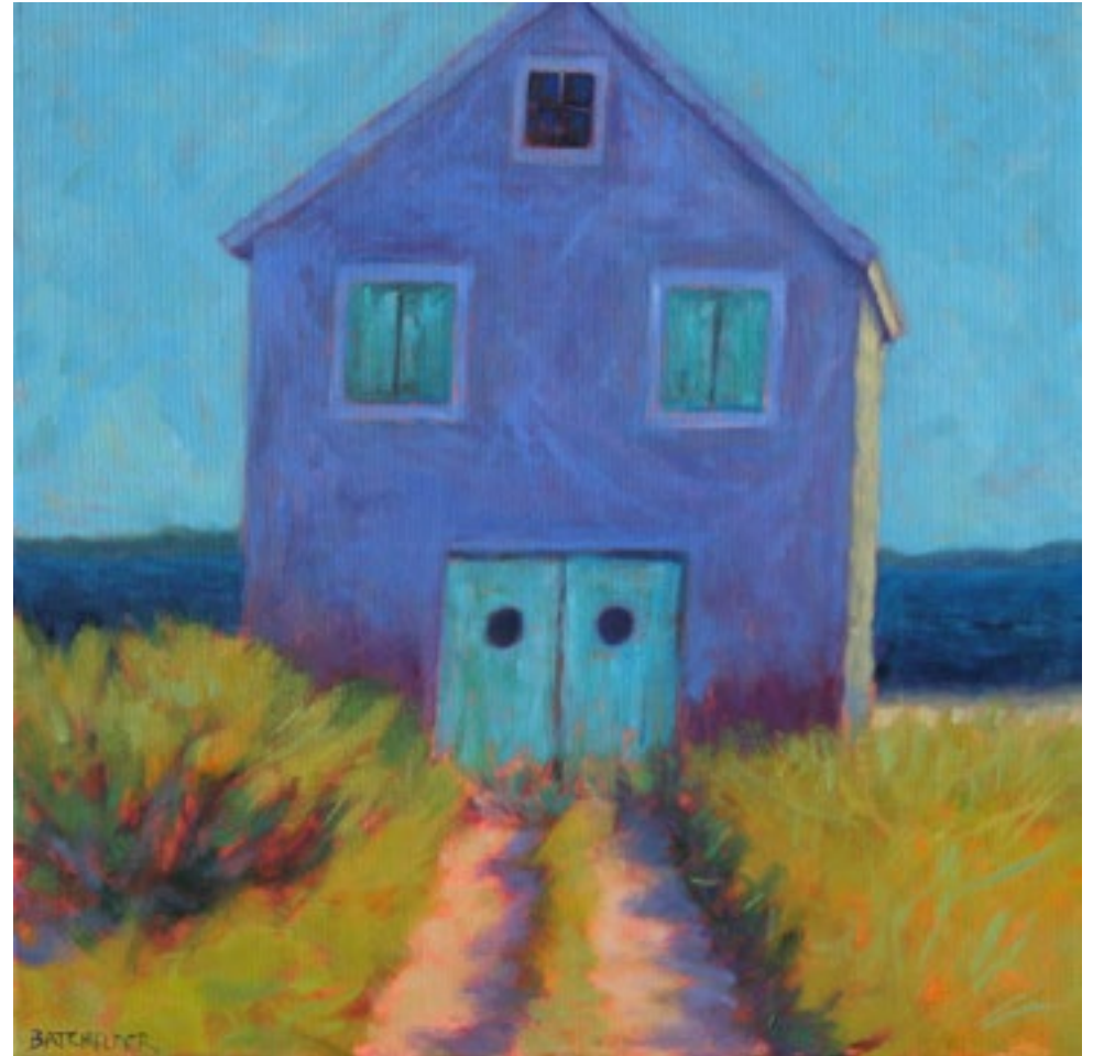
“Beside the Sound” 20”x20” oil on canvas