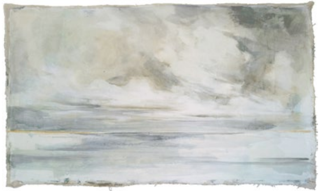
“Moving Forward” 36”x60” oil on canvas attached to panel