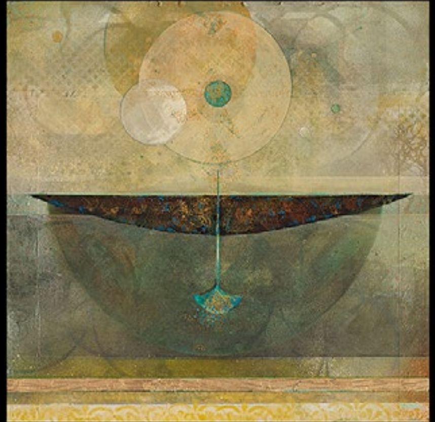
“Buried Treasures” 30”x 30” x 2” mixed media