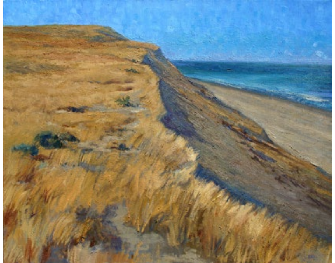
"Into Spring" 24"x30" oil on linen