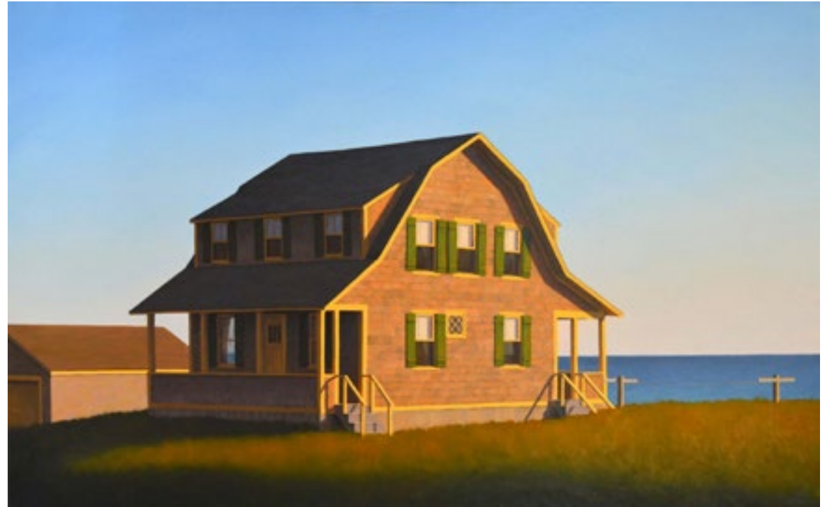
"Seaside Gambrel" 30"x48" oil on canvas

"A beached catboat or light slanting on clapboards and through windows, these are simple forms I find endlessly fascinating in how different light affects the mood."