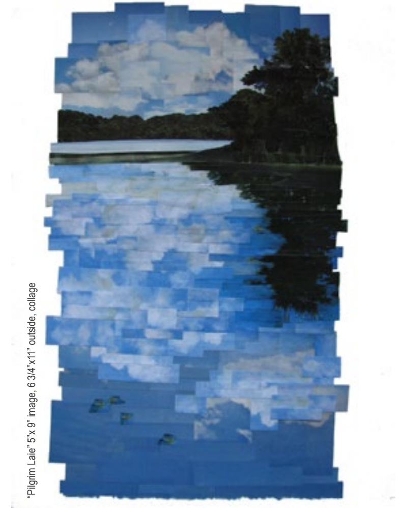
"Pilgrim Lane" 5'x 9' image, 6 3/4'x11" outside, collage