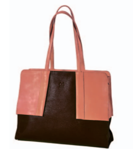
TRENCH-BAG CHOCO-CORAL 40 x 30 x 12cm