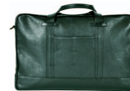
OFFICEBAG FOREST 45 x 32 x 12cm