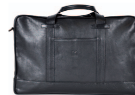
OFFICEBAG BLACK 45 x 32 x 12cm