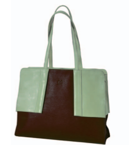
TRENCH-BAG CHOCO-PISTACHIO 40 x 30 x 12cm