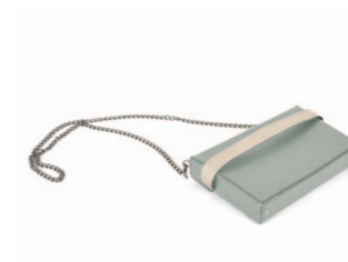
STELLA CLUTCH PISTACHIO 25 x 13 x 4cm