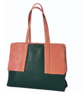
TRENCH-BAG FOREST-CORAL 40 x 30 x 12cm

The organic leather from Brittany, France, is vegetable tanned in Tuscany, Italy and handcrafted in Venice, Italy. The bags are then handfinished and shipped from Zurich, Switzerland. Vegetable tanned leather has the benefits of being chrome free, hypoallergenic and biodegradable.