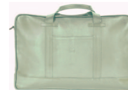
OFFICEBAG PISTACHIO 45 x 32 x 12cm