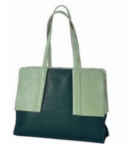
TRENCH-BAG FOREST-PISTACHIO 40 x 30 x 12cm