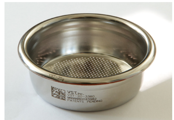
VST 20-gr Precision Competition Filter Official Filter of the WBC Championship

RoHS; ECHA REACH; EU GENERAL - German, Italian, French; US FDA