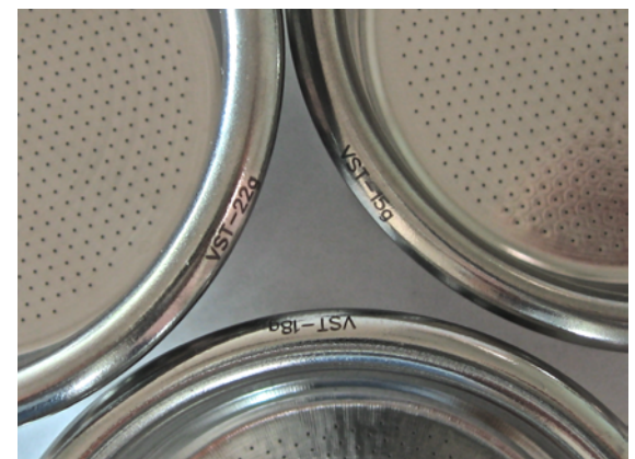
Also Available in 15g, 18g, and 22g Capacities All sizes available in standard & ridgless models

Available Now Order online at: www.vstapps.com