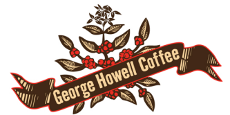
George Howell Coffee