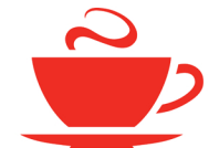
HAS BEAN COFFEE WWW.HASBEAN.CO.UK