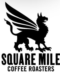
SQUARE MILE COFFEE ROASTERS