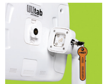
MagDock head release