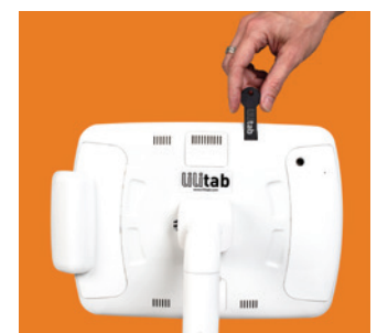
MagKey for sleep