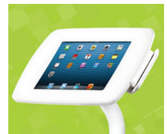
Optional liliSwipe card reader