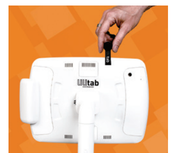
MagKey for sleep