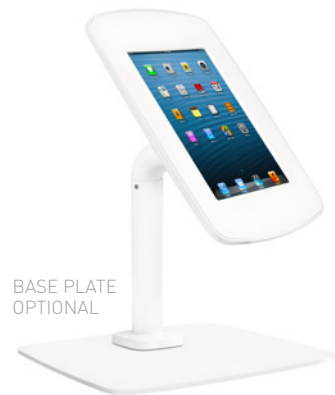
BASE PLATE OPTIONAL