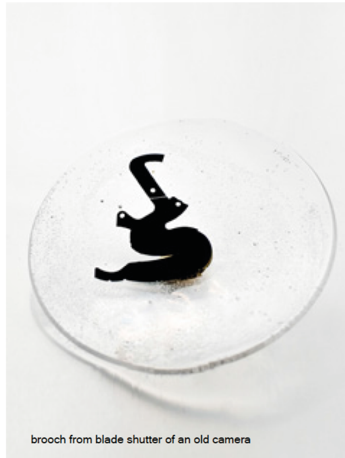
brooch from blade shutter of an old camera