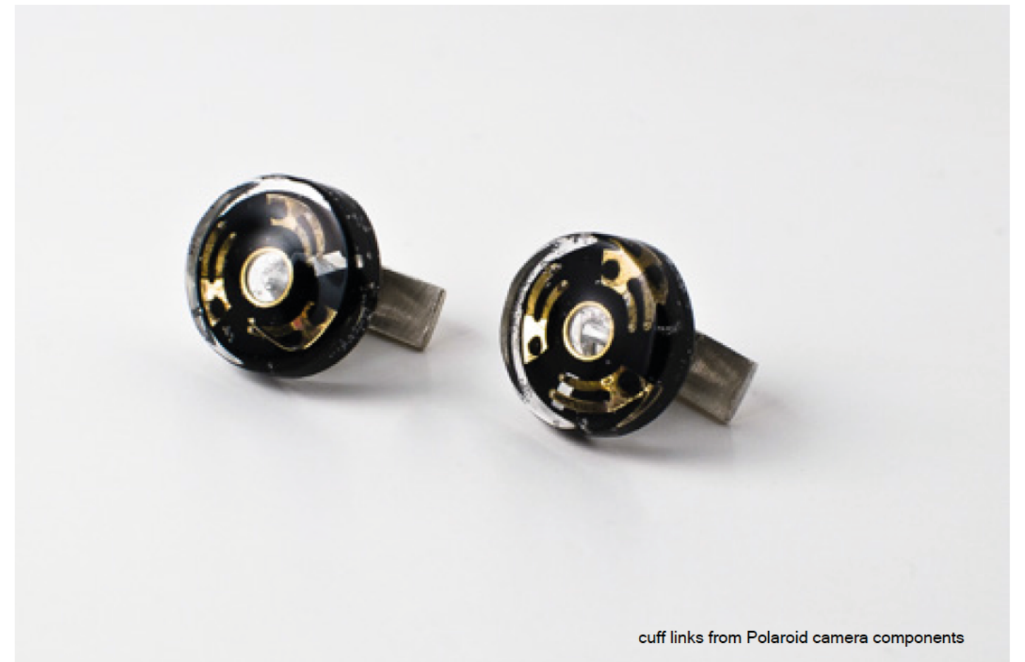
cuff links from Polaroid camera components