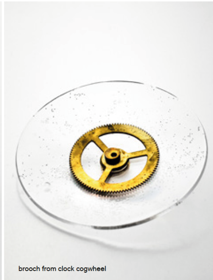
brooch from clock cogwheel