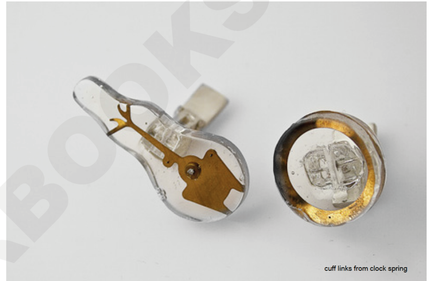
cuff links from clock spring