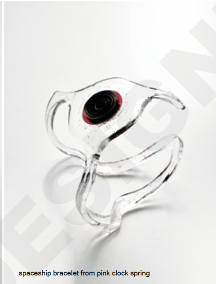
spaceship bracelet from pink clock spring