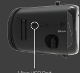
Micro USB Port for Charging

Via AC Adapter/Wall Charger: Using the provided Micro USB cable, connect your VR Headset (Micro USB port) to the AC Adapter (USB port) - not included.