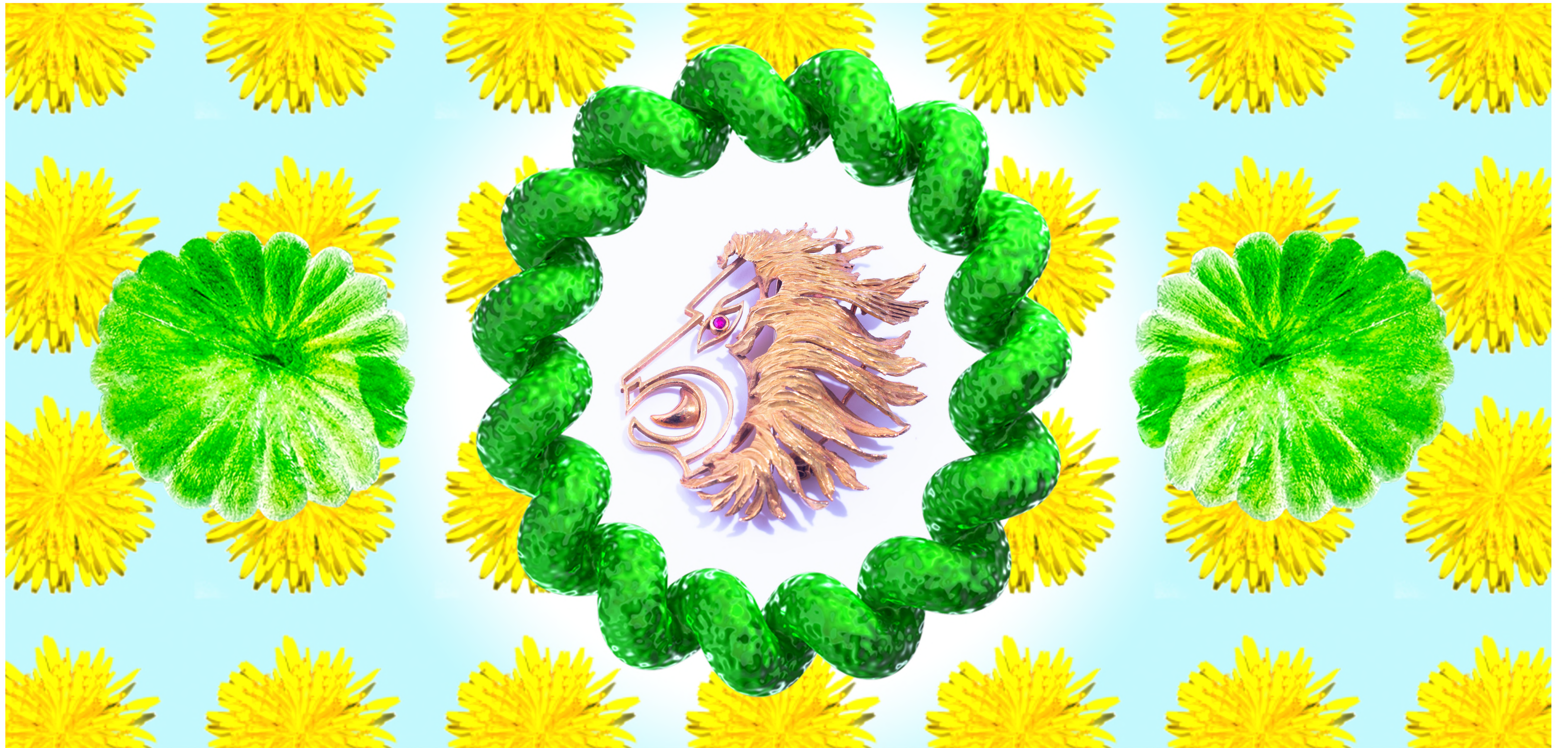
Jean Cocteau - Lion brooch