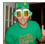
Another Drunk Athlete