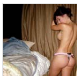
Epic Sideboob [PICS]