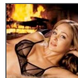
Fireside Hotties [PICS]