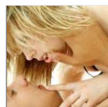
6 Sex Myths