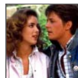
Dating Tips From Marty McFly