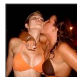
She's Delicious [PICS]