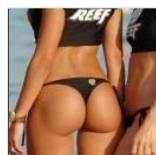
Surfs Up! [PICS]