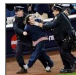
Insane Fan Storms Yankee Stadium [PICS]