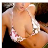
Sexiest Sportscasters [PICS]