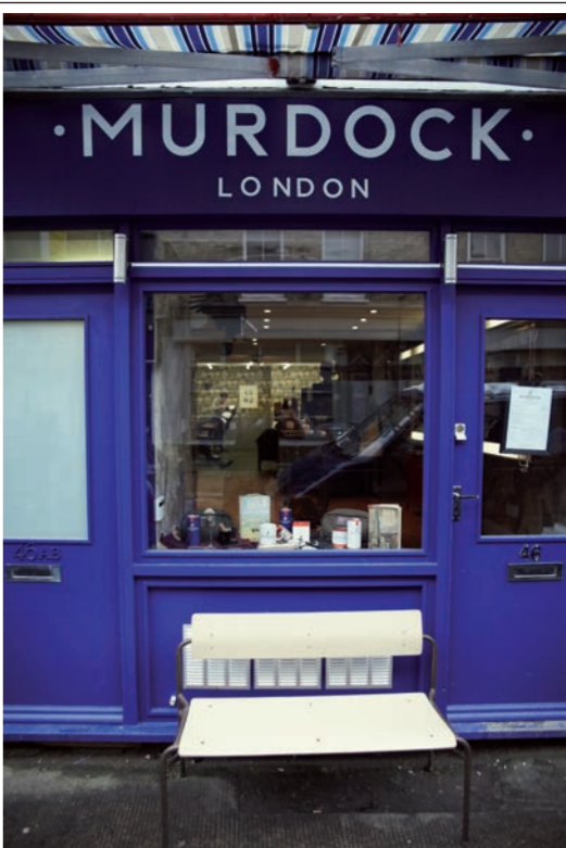
43 Murdock London Late event Tues 17th until 9pm Open daily 10am-6pm 46 Redchurch St, E2 7DP

Handmade Burro e Salvia is Shoreditch's first 'Pastificio'. Fresh pasta is handmade daily within comfortable surroundings inspired by a truly Italian home. Burro e Salvia celebrates the processes, small rituals, and joys of slowing down and making things by hand with TADA, the handcrafted letterpress notebooks by designers Apple & Pear.