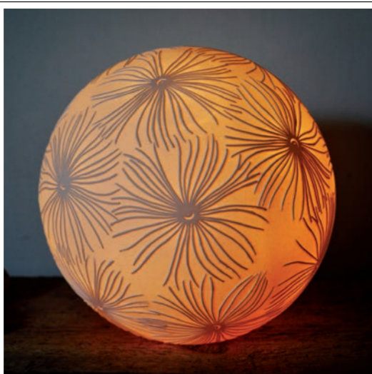
28 The Geffrye Museum of the Home 20th-22nd September geffrye-museum.org.uk Late event Thurs 19th 6pm-8.30pm Fri-Sat 10am-5pm Sun 12pm-5pm 136 Kingsland Rd, E2 8EA