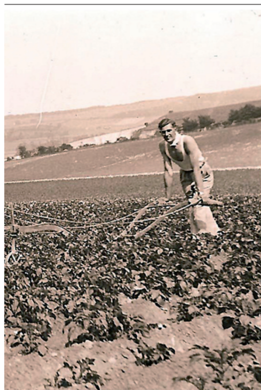
38 Luna & Curious Late event Tues 17th until 8.30pm Mon-Sat 11am-6pm, Sun 11am-5pm Plus additional events and workshops 24-26 Calvert Ave, E2 7JP

Food — Colouring Katherine May makes natural dye colours with produce from the shop. The nature of colour has been displayed through the gradation of an exhaust dye process that reuses the water in the dye bath until the colour runs out. In partnership with Water — Colour, this exhibition raises awareness of water consumption in the production and use of textiles.