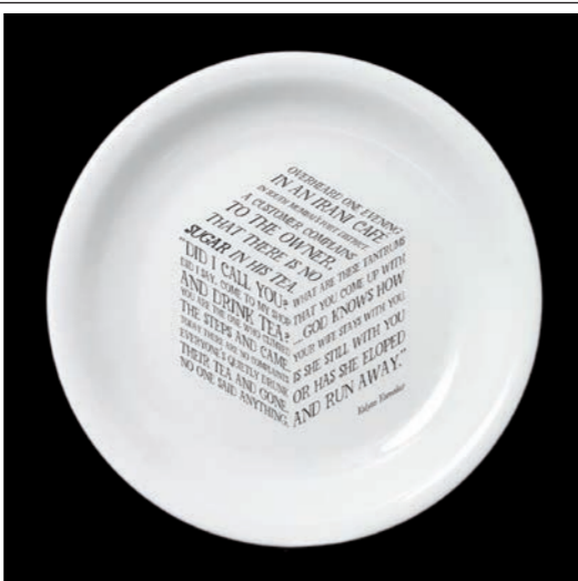
31 Dishoom Late event Tues 17th Drinks & talk from 5.30-7pm Mon-Thurs 8am-11pm, Fri 8am-12am Sat 9am-12am, Sun 9am-11pm 7 Boundary St, E2 7JE

VG&P at Two Columbia Rd Gallery VG&P will be launching and showcasing new pieces of furniture and accessories at Two Columbia Road Gallery. The VG&P collection will be on display alongside selected items of collectable furniture, associated design, works of art and photography selected by Two Columbia Road.