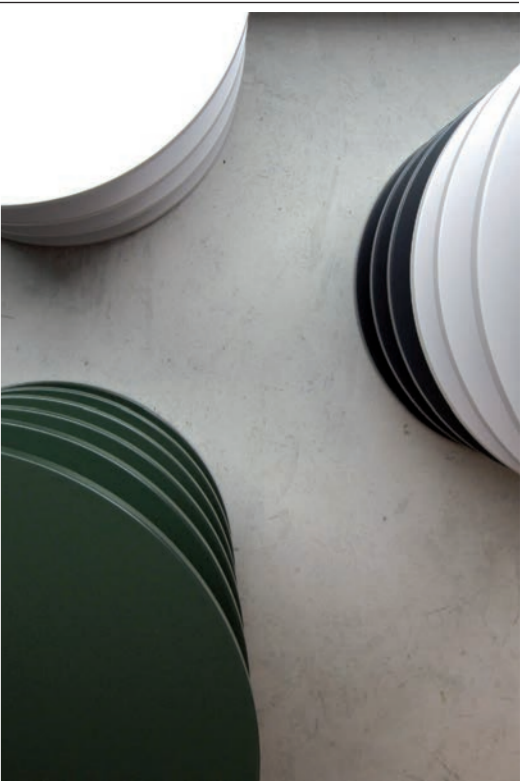
46 CAFEAND Late event Tues 17th until 8pm Wed-Sun 10.30am-6pm 77 Redchurch St, E2 7DJ

Handmade Burro e Salvia is Shoreditch's first 'Pastificio'. Fresh pasta is handmade daily within comfortable surroundings inspired by a truly Italian home. Burro e Salvia celebrates the processes, small rituals, and joys of slowing down and making things by hand with TADA, the handcrafted letterpress notebooks by designers Apple & Pear.