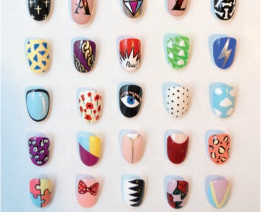
47 Boudoir Beauty Parlour Late event Tues 17th until 8pm Mon-Wed & Sat 10am-6pm Thurs-Fri 10am-8pm Sun by appointment only 1a Turville St, E2 7HX

CAFEAND Editions 2013 CAFEAND presents Editions 2013 comprising the Disko side shell/table and Species Volume table/stools. They are also serving architectural shaped pudding.