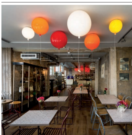
41 Les Trois Garçons Late event Tues 17th until 9pm Mon-Fri 8am-7pm Sat-Sun 9am-7pm 45 Redchurch St, E2 7DJ

Perfume, Sir? Enter DesignMarketo's world of fragrance and discover pepper as you have never seen it before. Perfume, Sir? is an exhibition of specially commissioned objects, scents, flavours, workshops, fine dining and cocktails inspired by and infused with pepper. Explore your senses and experience the ordinary as the abnormal.