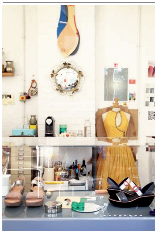
27 Camper & Disegno Tues 17th & Sat 21st 3pm-6pm Start: Disegno 283 Kingsland Rd, E2 8AS End: Camper 107a Commercial St, E1 6BG