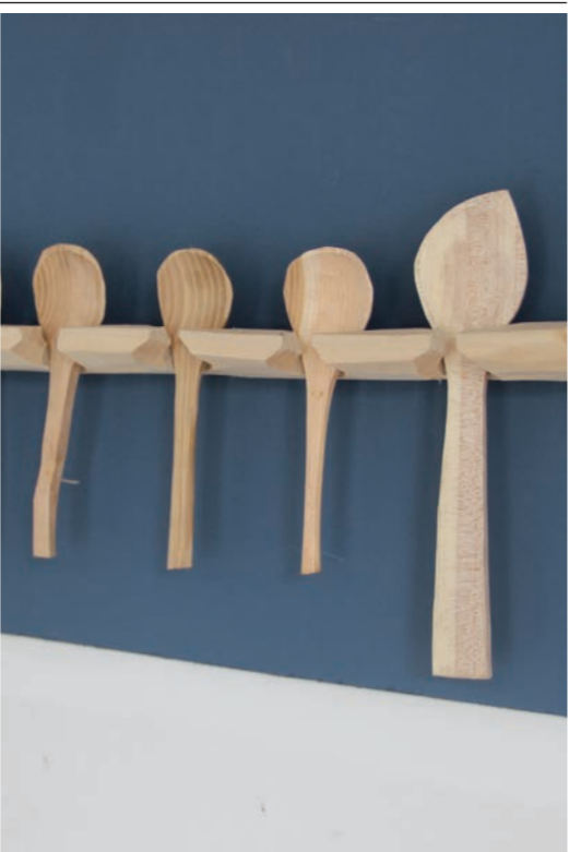
34 Barn the Spoon Late event Tues 17th until 9pm Fri-Tues 10am-5pm 260 Hackney Road, E2 7SJ

VG&P at Two Columbia Rd Gallery VG&P will be launching and showcasing new pieces of furniture and accessories at Two Columbia Road Gallery. The VG&P collection will be on display alongside selected items of collectable furniture, associated design, works of art and photography selected by Two Columbia Road.