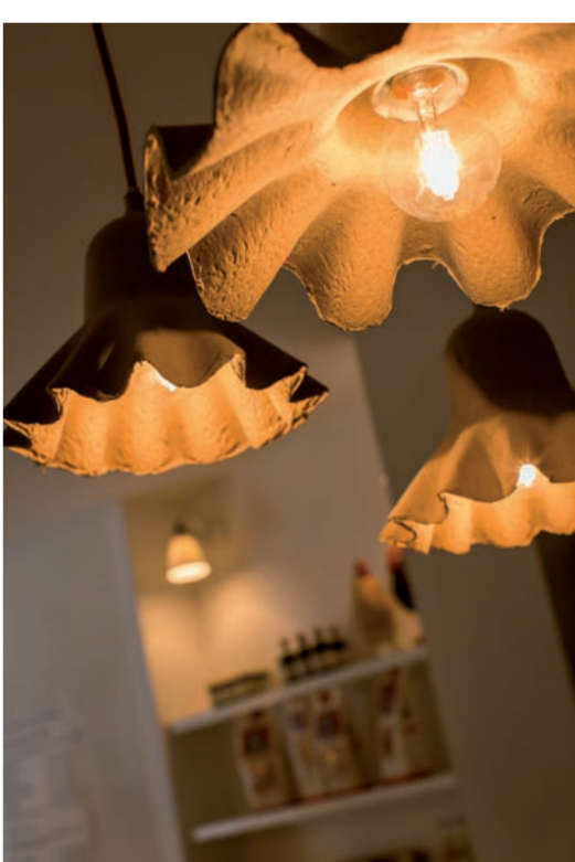
45 Burro e Salvia Late event Tues 17th until 8pm Mon-Sat 10am-7pm Sun 11am-5pm 52 Redchurch St, E2 7DP

PDD's Human-Centred Design Workshops and events Join PDD in looking, understanding and making, the key HCD skills for facilitating creativity. Throughout the week PDD will be running HCD teaser workshops and exploring the role culture and context plays in design and street art. Stop by to meet PDD's practitioners and see what they've been up to.