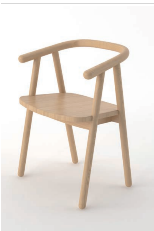
33 Very Good & Proper Late event Tues 17th until 10pm Wed-Fri 12pm-7pm Sat 12pm-6pm, Sun 10am-3pm Two Columbia Road 2 Columbia Rd, E2 7NN

(No)mad Table Tusch und Egon love collecting things. Since 2012, they have been selling limited editions of beautiful products by contemporary artists from around the world. The eclectic mix includes cool, chic gadgets, paintings, prints, sculptures and jewellery with a twist. See the launch of Tusch und Egon's new furniture series.