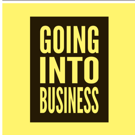
26 18 Hewett Street Late event Tues 17th until 9pm Mon-Fri 8am-6pm Sat-Sun 11am-6pm 18 Hewett St, EC2A 3NN

Hey! You got a Light? Maiden is delighted to present a range of wonderful lights designed by Mr Maria, a Dutch design duo who began making the fabulous Miffy lights (also featured at Maiden) and have now increased the range. A Polar Bear, an Elephant and a Geisha light are just a few examples of what's on show.