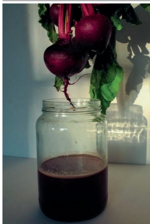
37 Leila's Shop Late event Tues 17th until 9pm Tues 4pm-9pm, Wed-Sat 10am-6pm Sun 10am-5pm 15-17 Calvert Ave, E2 7JP

Living by Design Where design is an afterthought in too many hotels and restaurants, it lies at the very heart of the Boundary. Bringing design and food together, the Boundary becomes more than a restaurant but a way of living.