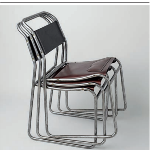
35 Ally Capellino Late event Tues 17th until 9pm Tues-Sat 11am-6pm Sun 11am-5pm 5 Calvert Ave, E2 7JP