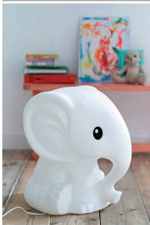
25 Maiden Late event Tues 17th until 8.30pm Mon-Fri 11am-7.30pm Sat-Sun 11-6pm 188 Shoreditch High St, E1 6HU

Hey! You got a Light? Maiden is delighted to present a range of wonderful lights designed by Mr Maria, a Dutch design duo who began making the fabulous Miffy lights (also featured at Maiden) and have now increased the range. A Polar Bear, an Elephant and a Geisha light are just a few examples of what's on show.