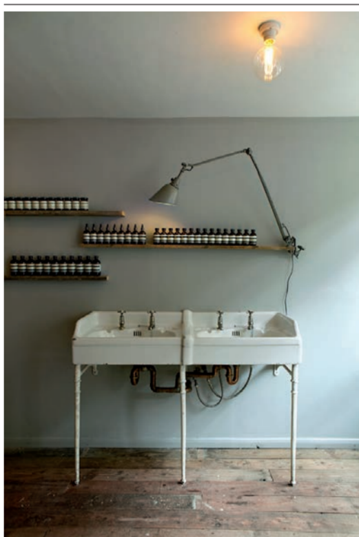
42 Aesop Late event Tues 17th until 7pm Mon 11am-6pm, Tues-Fri 11am-7pm, Sat 10am-6pm, Sun 11pm-5pm 44 Redchurch St, E2 7DP

DP pour Les Trois Garçons Les Trois Garçons presents a debut collection of furniture in collaboration with Portuguese furniture manufacturer De Pau. The new collection of tables, shelving and seating are on show at Maison Trois Garçons, their newly redesigned lifestyle café in Shoreditch.