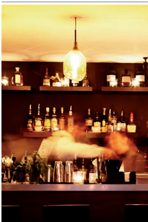
30 Decode Late event Tues 17th until 12am Tue-Fri 12pm-5pm Bar open Wed-Sun 5pm-12am The Looking Glass 49 Hackney Rd, E2 7NX

Library of Design, Flonda & December Chairs For the duration of the London Design Festival the Jasper Morrison shop has been transformed into a library. Chairs from the Flonda family, recently designed for Mattiazzi are also on show along with the December chair designed for Nikkari.