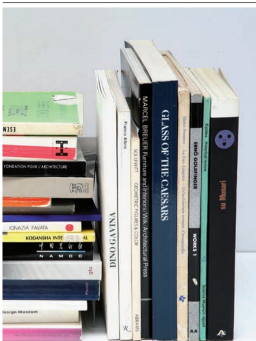
29 Jasper Morrison Shop Late event Tues 17th until 8pm Mon-Fri 11am-5pm Sat 12am-6pm 24b Kingstand Rd, E2 8DA

Ceramics in the City The Geffrye Museum's annual celebration of ceramics has returned this September. Featuring around 50 ceramicists from across the UK, the event showcases the work of both leading names and rising talents. An exciting array of work is on sale, illustrating a wide variety of techniques, styles, textures and colour.