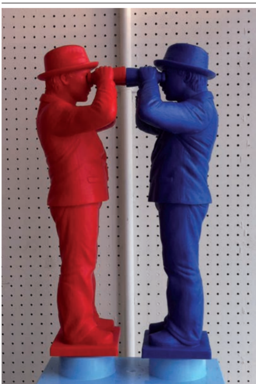
32 Tusch und Egon Late event Tues 17th until 9pm Mon-Sat 11am-7pm Thurs 11am-8pm, Sun 12am-6pm Unit 7, Boxpark 2-4 Bethnal Green Rd, E1 6GY

The Provenance of Bombay Cafés Dishoom will host one of This is Provenance's curated 'Contemporary Cabinets of Curiosity' showcasing a selection of its own beautifully designed story plates. These plates share memories of the original Irani cafés in Bombay to which Dishoom pays homage. Diners are invited to add their own stories which may then be included in the collection. On Tuesday night there will be a talk by OglivlyOne who were behind the plates. To pre-book your seat, send an email to hello@dishoom.com