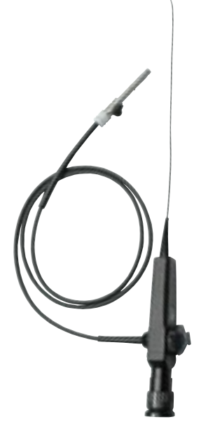
ENT-2L Scope 49-5020