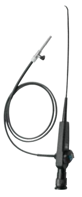
ENT-4L Scope 49-5040