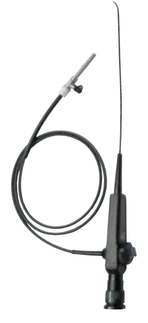
ENT-3L Scope 49-5030