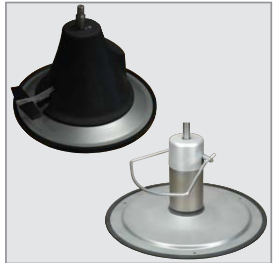
Standard 110 V motorized lift base Manual pump base