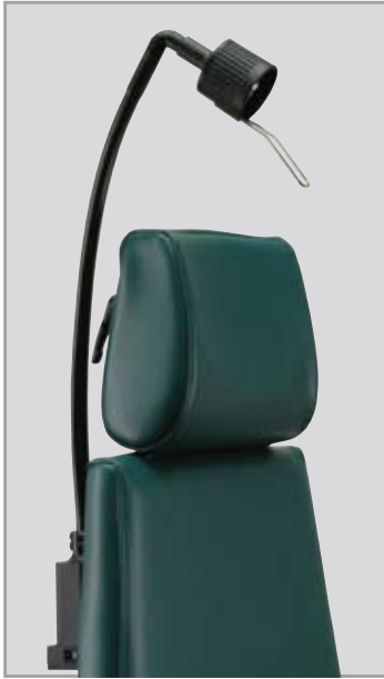
04-1590 Halogen Exam Lamp