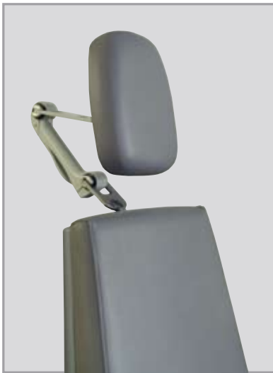
04-1596 Fully Articulating Headrest