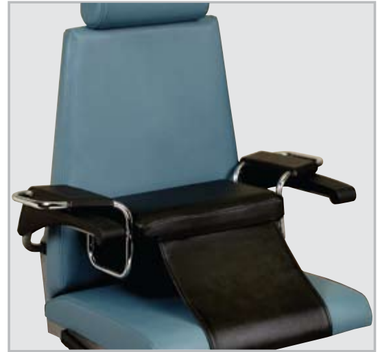
04-1220 Pediatric Booster