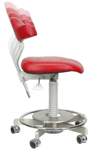
Backrest Height Adjustments