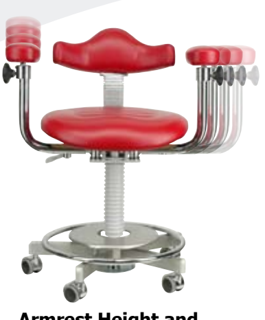
Armrest Height and Width Adjustments