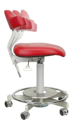
Backrest Tilt Adjustments

Getting your body into the proper position before any procedure is extremely important and one of the most overlooked, but necessary parts of every procedure. Sitting in the correct position can not only make the procedure more comfortable, but it can actually extend the years you can practice. The JEDMED Micro Stool was designed with comfort and ergonomics in mind.