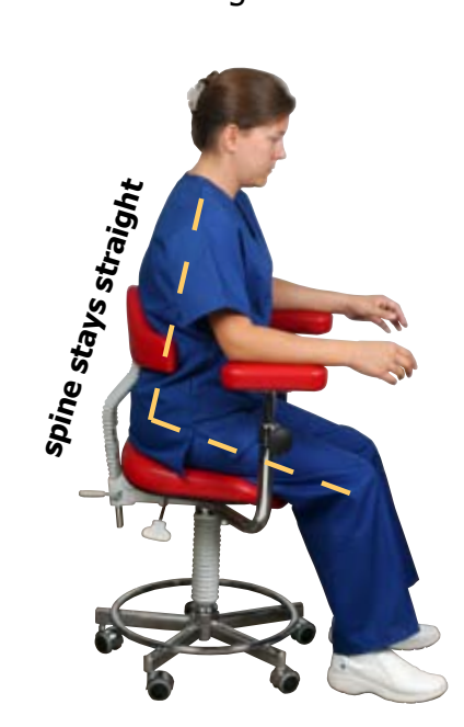
Tilted Forward Position