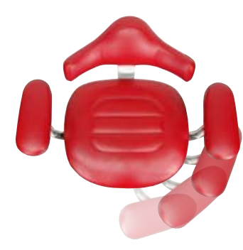
Armrest Radius (applies to both armrests)