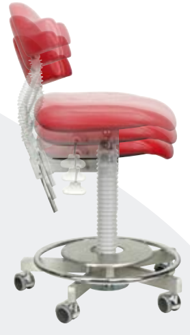
Seat Height Adjustments