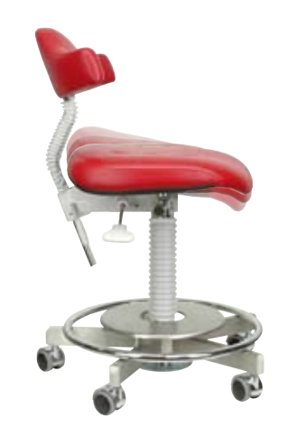
Seat Tilt Adjustments