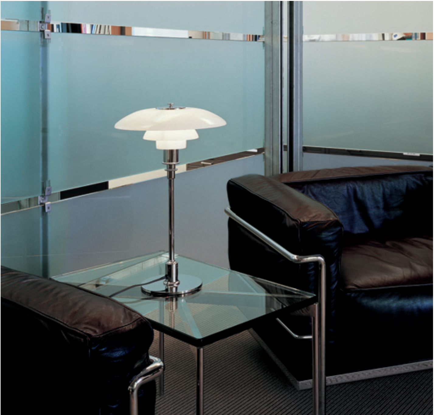
AC Martin Partners Los Angeles, California, USA Architect AC Martin Partners