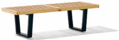
Nelson Platform Bench