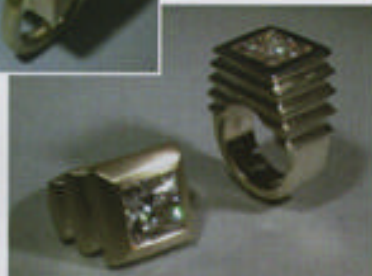
Pagoda rings are reminiscent of Asian architecture.